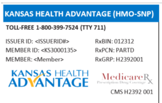
Front of card

Each Kansas Health Advantage Member will have a Kansas Health Advantage identification card and has been instructed to present it at each visit. The card will provide most of the information you need to process the patient through your system, including co-payment information and important phone numbers. Please see the sample card below.